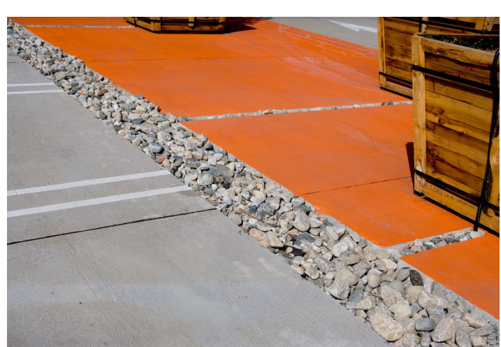
PUBLIC NATURE PROJECTS LLC